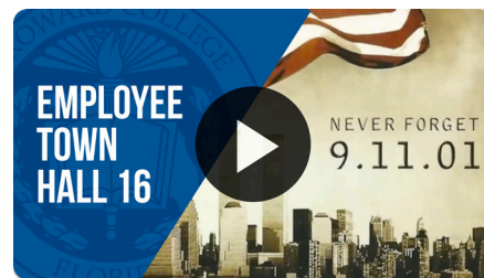
Click above to view the recording