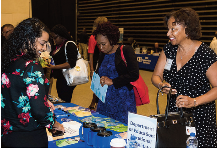
Participants get information from the Department of Education Vocational Rehabilitation team. One of the scores of exhibitors at the event.

The Supplier Relations and Diversity Program at the College and the State of Florida's Office of Supplier Diversity hosted the annual Supplier Diversity Day at the College's North Campus OMNI Auditorium on Thursday, August 28. Hundreds attended the event which helps small business owners learn about government contracting opportunities and interact with local prime contractors to pursue state, federal, and local government procurement opportunities.