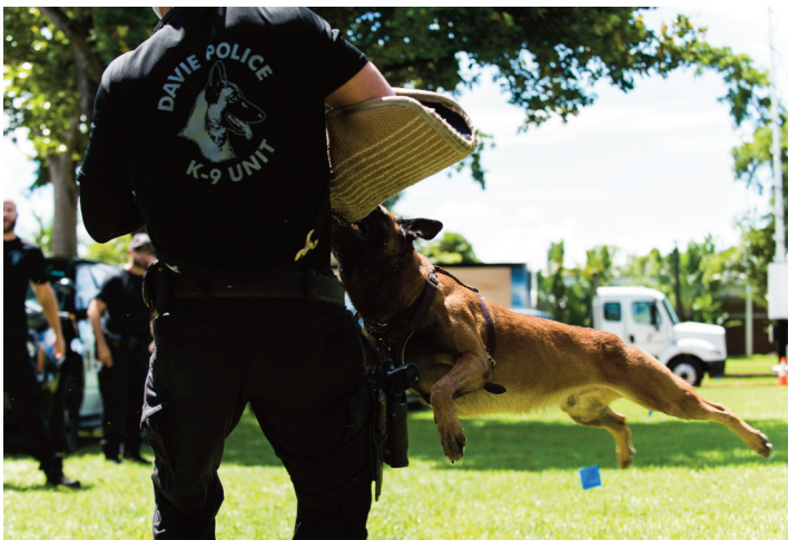
Davie Police K-9 Unit officer demonstrates the strength and abilities of his working police dog.

Hundreds of spectators watched the K-9 demonstration during the Campus Safety Day at the A. Hugh Adams Central campus on Wednesday, September 12. The events are rotated between each main campus and the Miramar West Center every Wednesday during September in recognition of National Campus Safety Awareness Month.