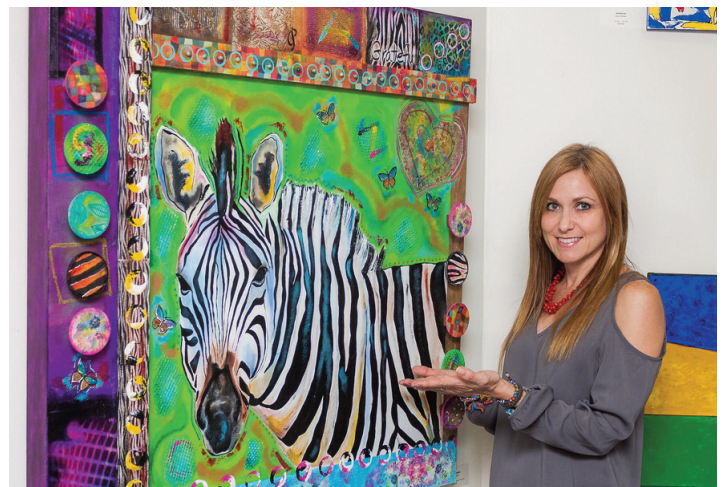
One of the featured artists proudly displays her work at the Hispanic Heritage art exhibition.

Attendees at the Hispanic Heritage Month Celebration enjoyed art, music, food and dancing at the exhibition at Bailey Hall.