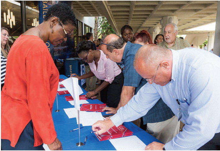
Adjuncts check-in for their Welcome Back event at Bailey Hall on Tuesday, August 14.

The College marked the start of the academic year with Welcome Back events for adjuncts and full-time faculty.