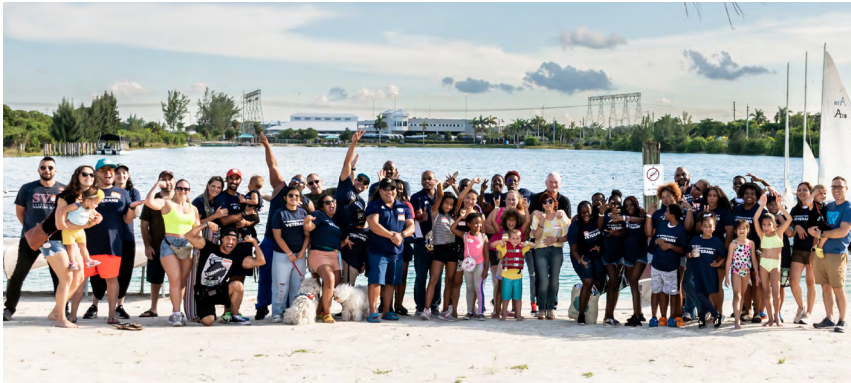
Attendees at the fourth annual Veterans BBQ.

On Saturday, September 10, the Office of Veterans Engagement hosted the fourth annual Veterans BBQ at Tigertail Lake Recreational Center in Dania Beach. This yearly event takes place to provide student and staff of the College who are veterans or active military personnel an opportunity to come together with their families and bond as a community.