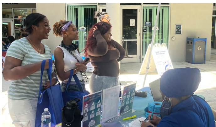
Students partake in activities offered campus-wide as part of the first-ever Broward College Spirit Day on September 6, 2022. The event was presented by Student Life.