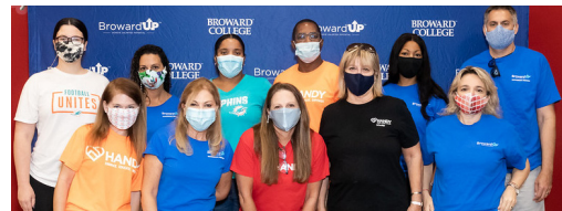
Broward College employees join other volunteers from HANDY and the Miami Dolphins before the start of the event on October 3.

On Saturday, October 3, Broward College teamed up with HANDY (Helping Abused Neglected Disadvantaged Youth) to host the Fresh Start Distribution event. Sponsored by Valley Forge Fabrics, 150 families from across the county participated in the drive-through event at the HANDY headquarters in Fort Lauderdale, where they received Luxury Beds in Bags, which included sheets, a duvet cover, and either a blanket or pillow, in addition to KN95 masks. The participating families also received Dutch Pot Restaurant gift cards courtesy of the Miami Dolphins; oximeters to measure heart rate and oxygen levels; fresh produce from FreshPoint; and personal hygiene products, including toothbrushes and toothpaste, and soap donated by Shiff Construction. Families also received Broward UP™ drawstring bags, pens, lanyards, and information about opportunities to upskill with Broward College for rapid re-entry into the job market.