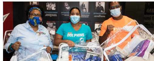
Volunteers display some of the Beds in Bags distributed at the event.