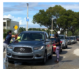
Volunteers place food items in the trunk of a student's car at the drive-through event on the A. Hugh Adams Central Campus on Friday, October 16.