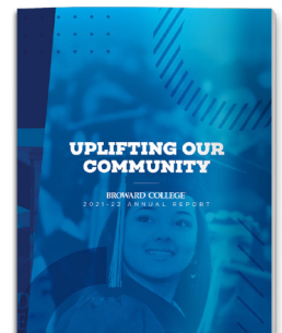
Click the image to read the 2021-22 Annual Report

On Thursday, October 20, Broward College officially unveiled its 2021-22 Annual Report. The title of the report is "Uplifting Our Community," and focuses on the transition from the five-year Strategic Plan to the newly developed Social Enterprise Plan. The Annual Report reveals how some of the College's previous work aligns with the Social Enterprise Plan's "Big Bets" framework—Guarantee Access to Education, Empower Student Development, and Create Impactful Career Connections. In addition to key metrics highlighting the success of Broward College programs, the report also includes testimonials from current students, recent graduates, employee partners, donors, and faculty members.