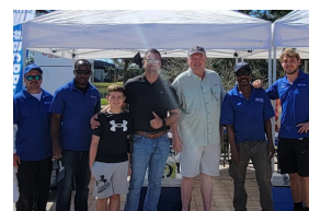
Members of the Broward College facilities team at Florida Southwestern State College.

Members of the Broward College facilities team packed two trucks and a large trailer with requested Hurricane relief supplies on Tuesday, October 4, and Wednesday, October 5, in support of Broward College’s ongoing response to Hurricane Ian and recovery efforts for Florida Southwestern State College (FSSC).