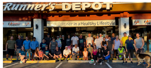
Participants at the the Fort Lauderdale event in Davie.