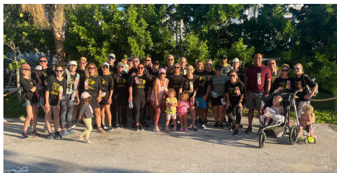
Supporters of the 5K run/walk for Dan’s House of Hope.