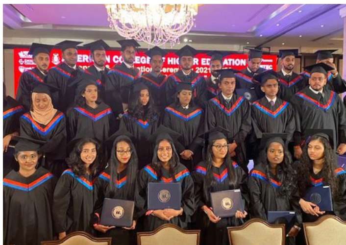
Graduates during the ceremony.