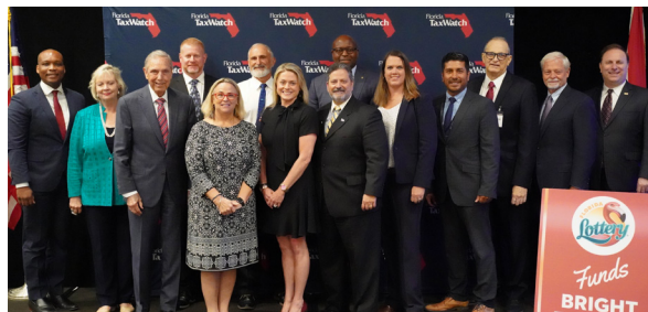
Florida TaxWatch board members.