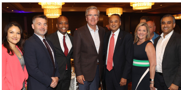
Broward College staff and trustee with Jeb Bush.