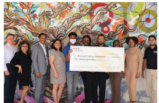
Representatives of the Broward College Foundation, staff, students and representatives of Peer Forward during the check handover at the College on Wednesday, April 30.

To address the financial hardships that Peer Mentoring and Leadership program students have faced due to the COVID-19 pandemic, PeerForward and one of its donors created the PeerForward/Greenwald Leadership Scholarship fund. The donation of $50,000 is an unprecedented effort to provide student mentees in need with up to $750 in emergency grants and will go into effect during the summer term. Broward College’s PeerForward program supports students identified as being at risk of not persisting in their education. One Peer Leader is matched with up to 15 mentees, primarily based on their educational pathway. Peer Leaders leverage PeerForward’s Reporting App to provide tailored interventions for mentees. Broward College and PeerForward staff provide coaching, skills development, resource sharing, and supervision throughout the mentorship process.