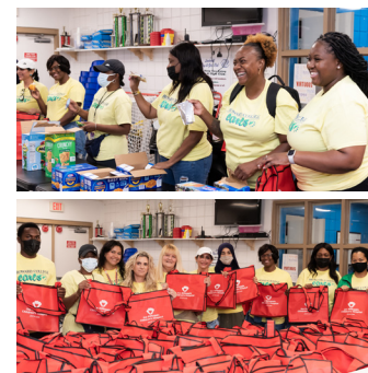
Volunteers sort books and create meal packs.

On Saturday, April 30, faculty, and staff of the College participated in the third and final BC Cares Day of Service event of the year. The 27 participants volunteered with Lauderhill Boys and Girls Club. They engaged in various service activities, including creating meal packs for the youth, landscaping (planting and mulching), reorganizing the library area, and assembling office furniture. After lunch, the Broward College volunteers participated in a game room tournament with the youth, playing pool, Connect Four, air hockey, and other games. The day ended with an impromptu basketball game in the gym. BC Cares offers college-wide volunteer opportunities to employees throughout the county, making it easier for employees and their families to support local causes.