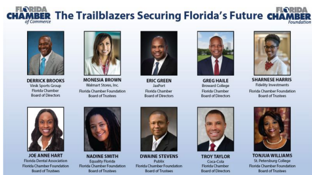
This LinkedIn post was made by the Florida Chamber on Thursday, February 17.