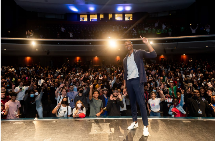
NBA All-Star Chris Bosh poses with students following his presentation at Bailey Hall on Thursday, March 17.