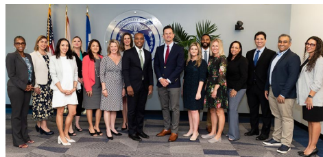
Participants from Broward College and the Florida Department of Education just before the start of the roundtable.

The new Broward College location at L.A. Lee YMCA/Mizell Community Center will offer courses and free certificates to students and community members, focusing on improving access and connecting residents to better earning potential while meeting our workforce needs. Residents can earn free certificates in Lean Six Sigma, Supply Chain Management, and Customer Service Operations with no diploma or other degree required. The College received $1 million in funding over the next four years to support its lease of the fourth floor of the YMCA facility.