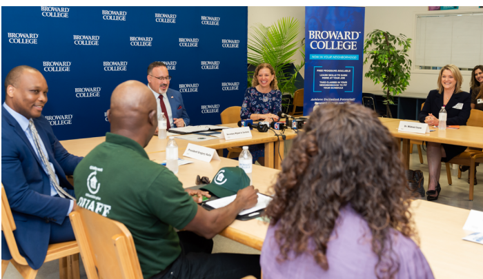
Participants during the roundtable at Cypress Bay High School on Monday, April 4.

The Secretary of Education’s visit was a great way to begin April, which is Community College Month.