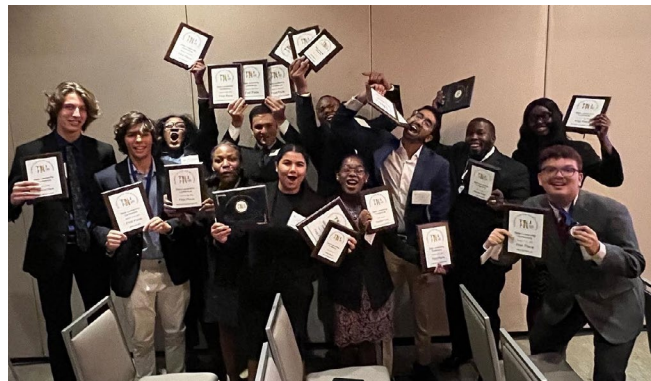
Members of the winning PBL team show their certificates.