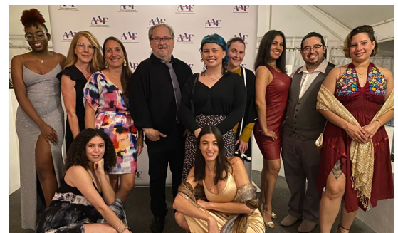
Student winners celebrate at the award ceremony with members of faculty and staff.

The American Advertising Federation (AAF) awards is the advertising industry’s largest and most representative competition, attracting nearly 30,000 entries every year in local AAF Ad Club competitions. This year, students from Broward College took home 18 awards from the AAF Fort Lauderdale chapter, including four GOLD ADDY’s, nine SILVER ADDY’s, two Judge’s Choice, Best of Brand, Best of Packaging and Best of Publication Design. The award ceremony took place on Thursday, February 17, at Lakeside Terrace in Boca Raton. The winners and their entries are: