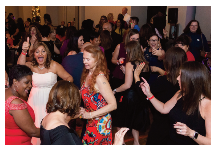
These bright faces on the dance floor give a 'thumbs up' to the holiday party celebrations.