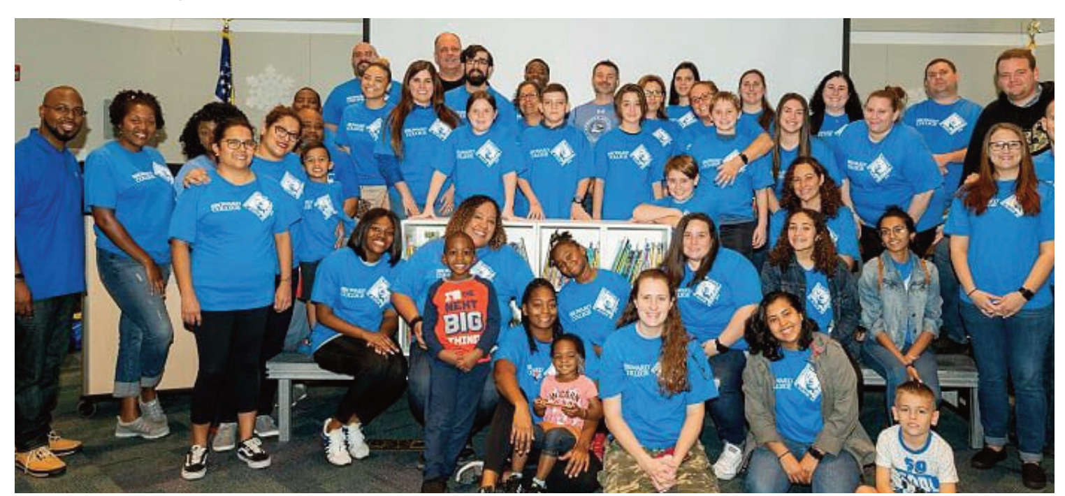
On Saturday, January 12, Broward College staff, students, and friends joined their efforts for one of the three projects awarded to the College under the MLK Day of Service grants. Organized by the Teacher Education Program (TEP) the volunteers constructed bookshelves and organized books and supplies that were delivered to barbershops in some of the areas served by Broward UP!