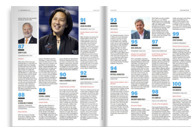
Click here to read the publication