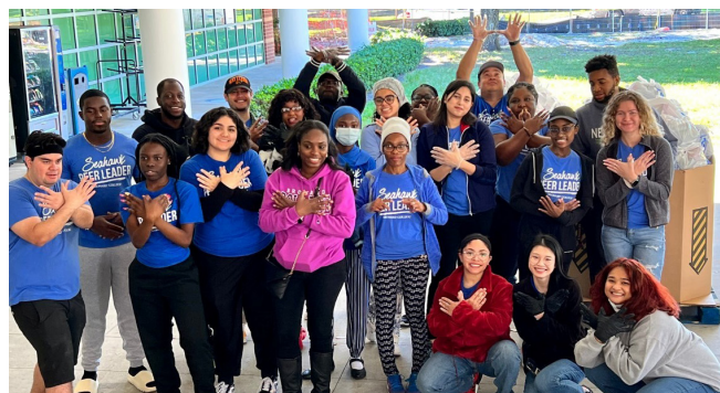
Participants show their Seahawk pride during the MLK Day of Service event on Monday, January 16, at A. Hugh Adams Central Campus.

Peer Leaders of the Peer Leadership and Mentoring program along with some College participated in a volunteer event on Monday, January 16, in honor of Dr. Martin Luther King, Jr. The participants helped pack 2,036 bags for LifeNet4Families and stock 15 pallets of food for the Seahawk Marketplace Food Pantry. LifeNet4Families provides a gateway to stability for people in Broward County experiencing hunger, homelessness, and poverty. The event was organized by the Sisterhood in the Workplace Employee Resource Group. Approximately 40 people attended the event. This is the third year that Broward College has hosted an MLK Day of Service. MLK Day is the only federal holiday designated as a National Day of Service to encourage all Americans to volunteer to improve their communities.