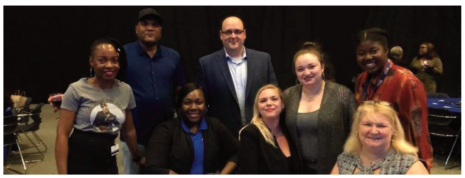
The first Social With a Purpose event, a new series of 'Happy Hour' networking opportunities launched to connect employees with community groups and partners, was hosted on November 14 at the Omni Auditorium on North Campus and included participants from two Broward UP municipalities.