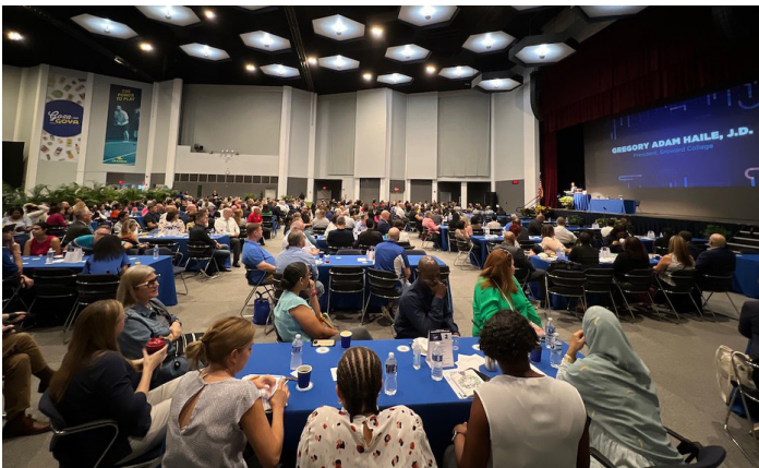
Caption: Faculty and staff gather for a morning of presentations, workshops, and networking as part of the 2023 Faculty and Staff Welcome Back meeting, which was held August 16 on North Campus.