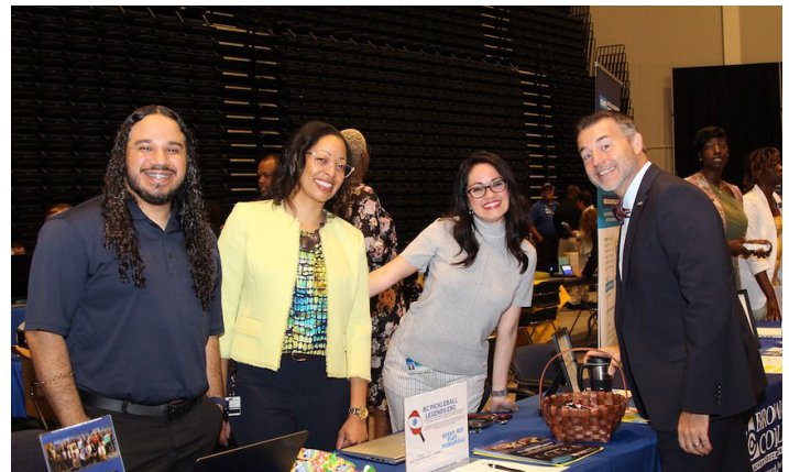
Caption: The Faculty and Staff Welcome back meeting began with a resource marketplace, where attendees could network with peers to learn about services, programs, and resources offered to faculty and staff at Broward College.