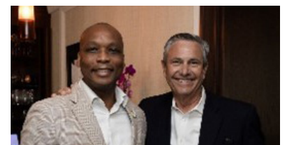
Top: Attendees pose for a photo at the 14th annual Pillars Conference in Fort Lauderdale.