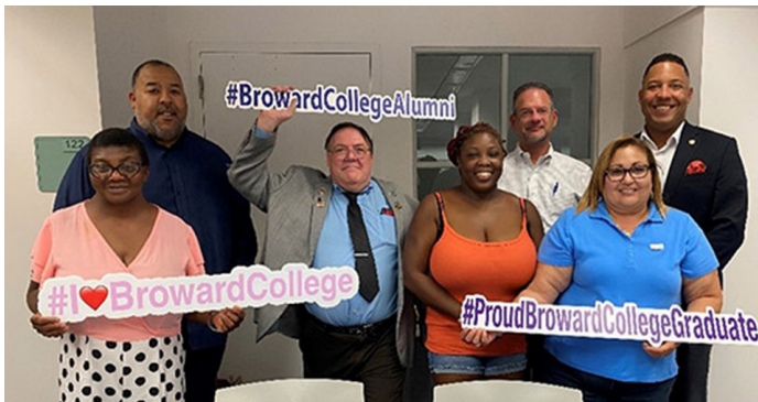
Caption: Broward College’s Hospitality and Tourism Management Alumni Committee shared goals and ideas for networking events during its first in-person meeting on June 21.