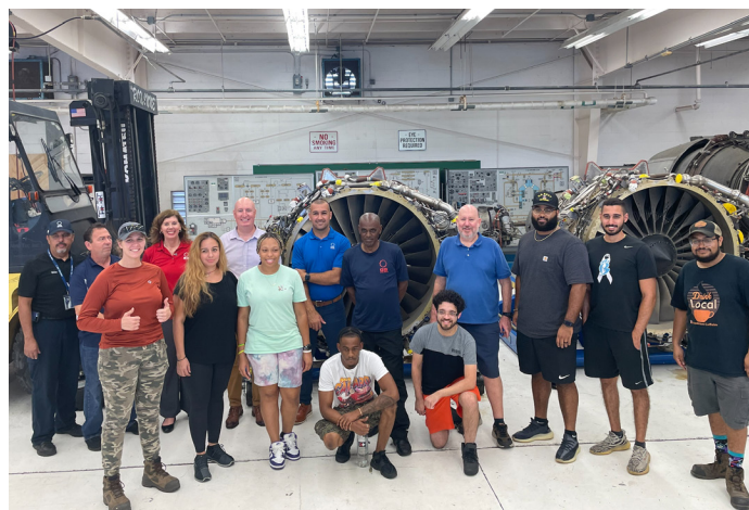
Broward College aviation students pose for a photo in front of the program's newly acquired General Electric turbofan jet engines.

Broward College's Emil Buehler Aviation Institute was the recipient of two General Electric CF34 turbofan jet engines. The engines were delivered on Tuesday, August 1. Typically found on large regional jets and business jets, these engines have an estimated value of $12.7M and will serve as an instructive addition to Broward College's aviation program. Staff and faculty members were on hand to organize the arrival. Broward College industry partners GA Telesis and MD Turbines donated the transportation services and forklift rental required to transport the jet engines.