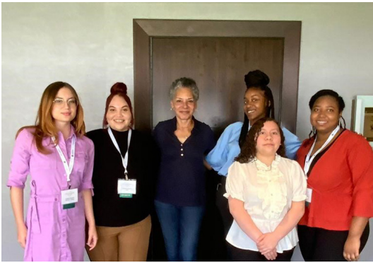
Students and staff from Broward College attended the Florida Women in Energy Leadership Forum in Fort Lauderdale. The three-day event was attended by women leaders in the energy industry from across the state.