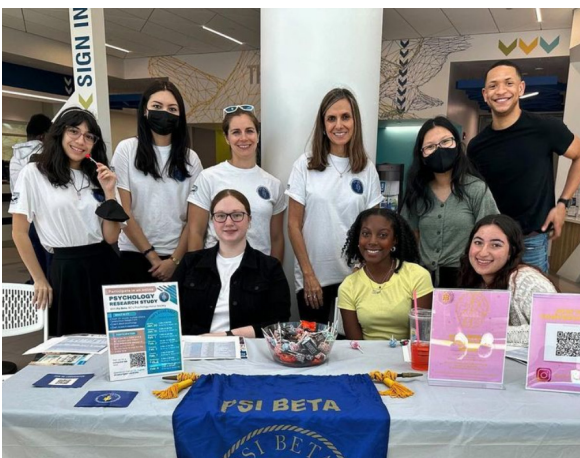
Broward College’s Psi Beta Society was awarded a 2023 Chapter Excellence Award for their excellence in engaging members in service, research, and leadership.