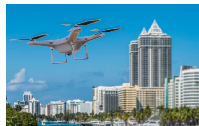
A grant from the National Science Foundation will help support Broward College’s Drones to Aviation Pathway.

Broward College has been awarded a prestigious National Science Foundation (NSF) grant for the Drones to Aviation Pathway (DAP) Project. The grant, totaling $454,038, is designed to support