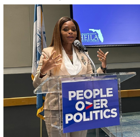
U.S. Congresswoman Sheila Cherfilus-McCormick presents on the one-year anniversary of the CHIPS & Science Act at a town hall meeting at Broward College North Campus

On Monday, August 7, congresswoman Sheila Cherfilus-McCormick (D-FL) hosted the U.S. Department of Commerce for a town hall event celebrating the one-year anniversary of the bipartisan CHIPS and Science Act. The event took place at Broward College North Campus and included remarks from representatives from the U.S. Department of Commerce, Broward College, Florida Atlantic University, and the National Science Foundation. Following remarks, the town hall event featured a resource fair, where attendees received additional information about local careers in STEM and innovation. Congresswoman Cherfilus-McCormick also announced roughly $3 million in grant funding for Broward College as part of the Connecting Minority Communities Pilot Program. This funding is part of the Biden-Harris Administration’s Internet for All initiative that aims to connect Americans with affordable, reliable high-speed internet service. Broward College received