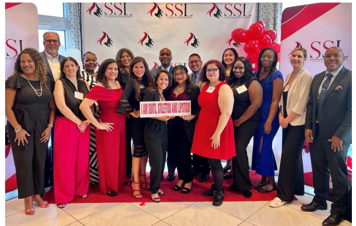
Ten Broward College students were among the honorees at the Heidi Dennis Wonder Woman Scholarship awards ceremony in Fort Lauderdale on August 8.