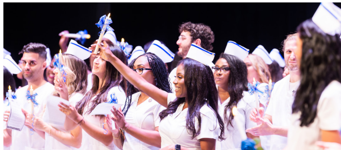
Broward College nursing students celebrate the completion of their degree during the Summer Candle Lighting Ceremony on Wednesday, August 8.