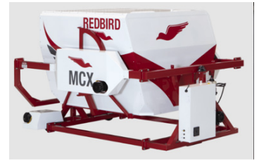
Caption: The MCX Redbird flight simulator

The Emil Buehler Perpetual Trust provided a philanthropic investment of $150,000 to fund classroom renovations and upgrades needed to accommodate four newly acquired, state-of-the-art Redbird flight simulators. The simulators will be a part of the Emil Buehler Flight Simulation Lab on the Judson A. Samuels South Campus. The addition of the new simulators will help build awareness and enthusiasm among the prospective local high school graduates and current Broward College students, laying the foundation for expanded enrollment and sustainability.