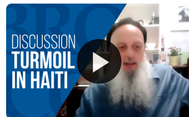
Click to watch the discussion