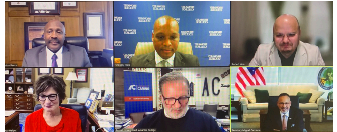
Click to watch the ceremony