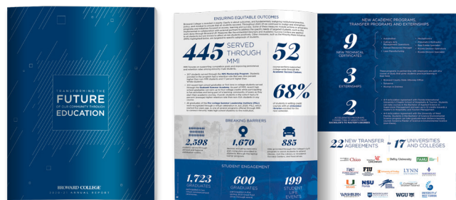
Click to read the report