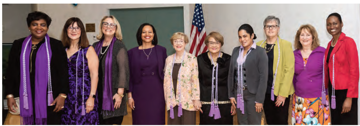
Sigma Theta Tau inducted Broward College students into the International Nursing Honor Society held recently at Florida Atlantic University's College of Nursing auditorium. The newly-established Sigma Theta Tau chapter-at-large at Broward College is chartered under Iota Xi at FAU. Recognized as the second-largest nursing organization in the world, Sigma Theta Tau enables students to collaborate on leadership, scholarly research and service activities that are usually reserved for universities with graduate-level nursing programs.